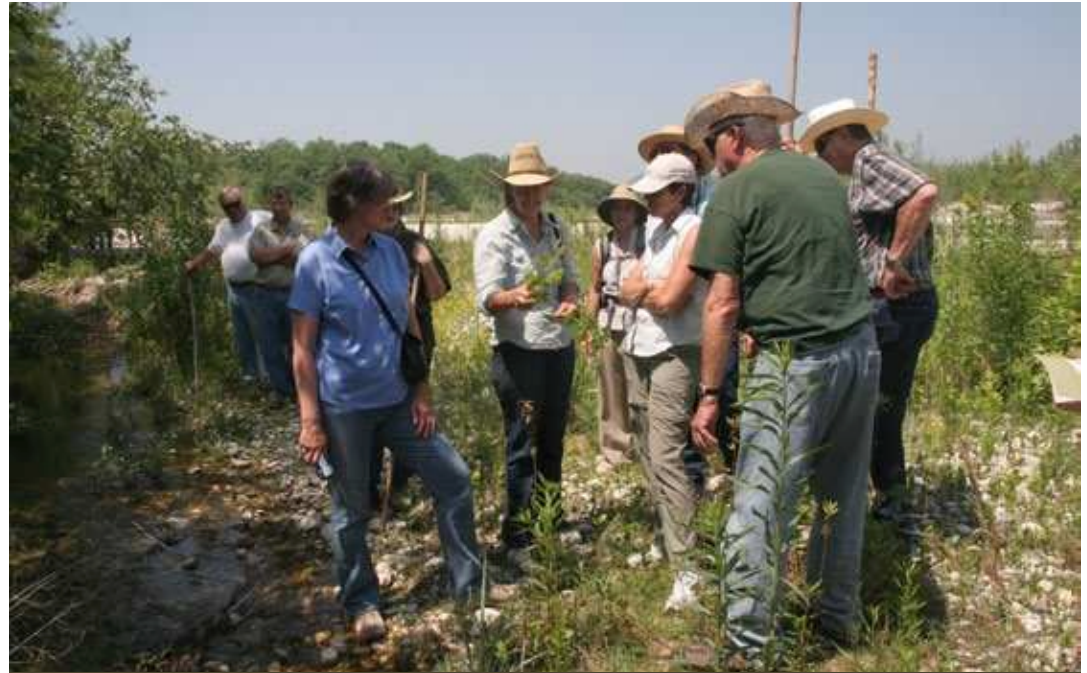
TEACHING THE IDENTIFICATION and value of riparian plants is a key part of a successful workshop.

A frequent comment heard from participants after a workshop is, "I'll never look at a creek the same way again." Lights seem to turn on as riparian dynamics are explained. Most participants have spent their lives around creeks and