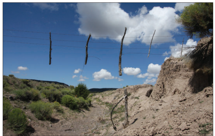
These fence posts rested on the ground in 1937.